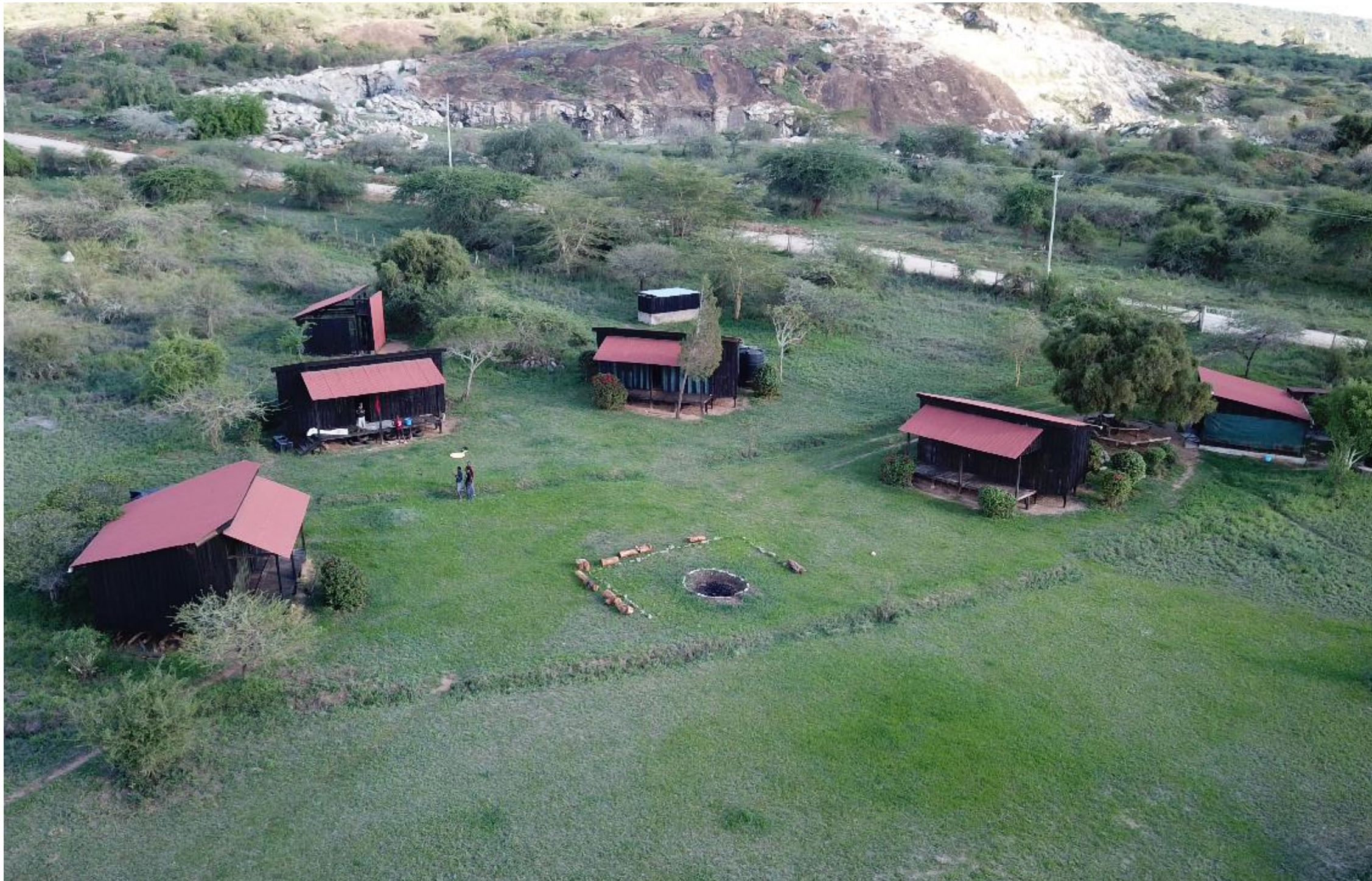
FREEDOM BASE – CABIN AREA