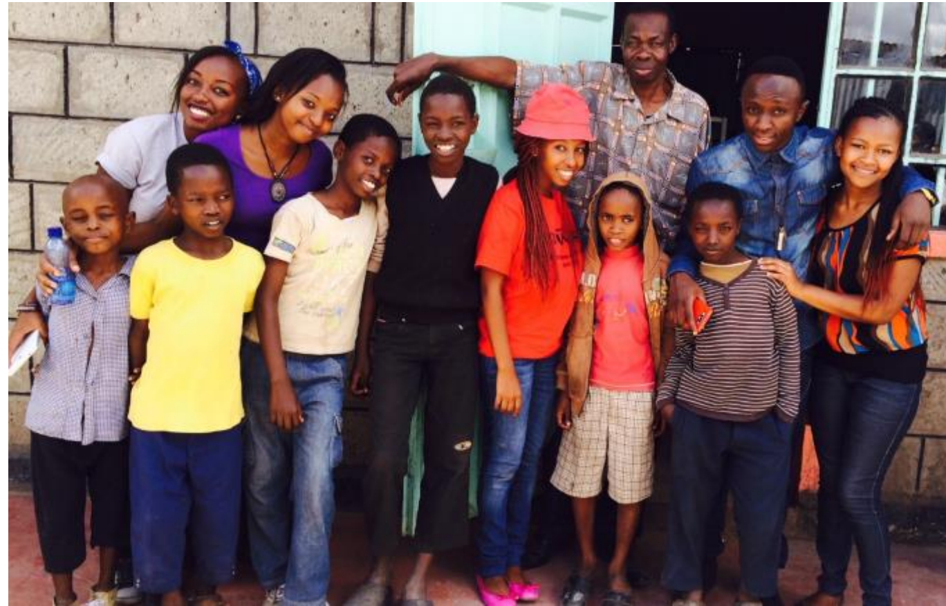
Positively Impacting The Community