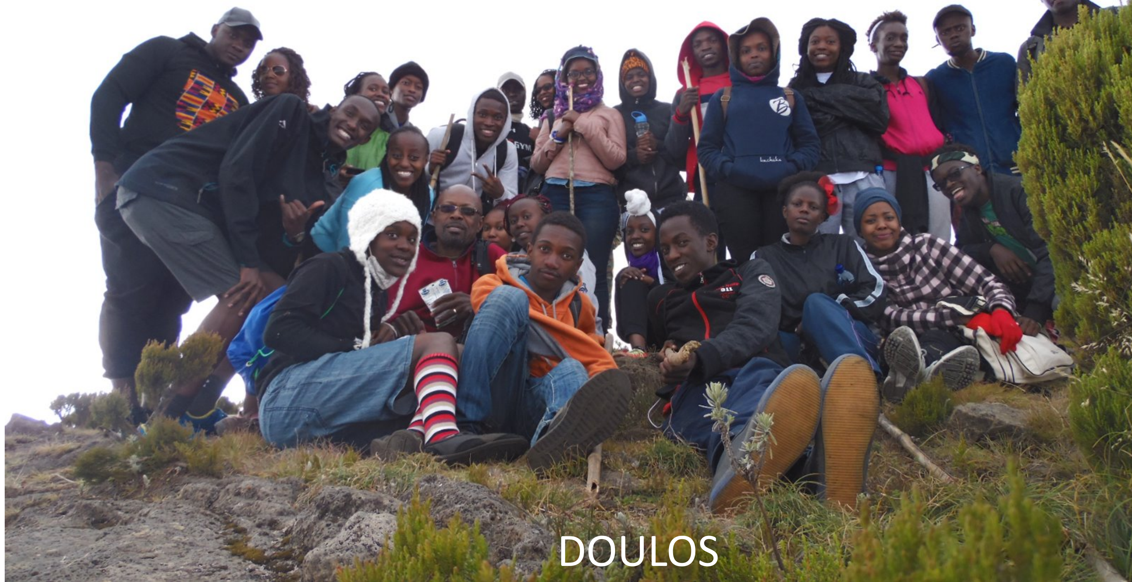
DOULOS LEADERS IN SERVICE