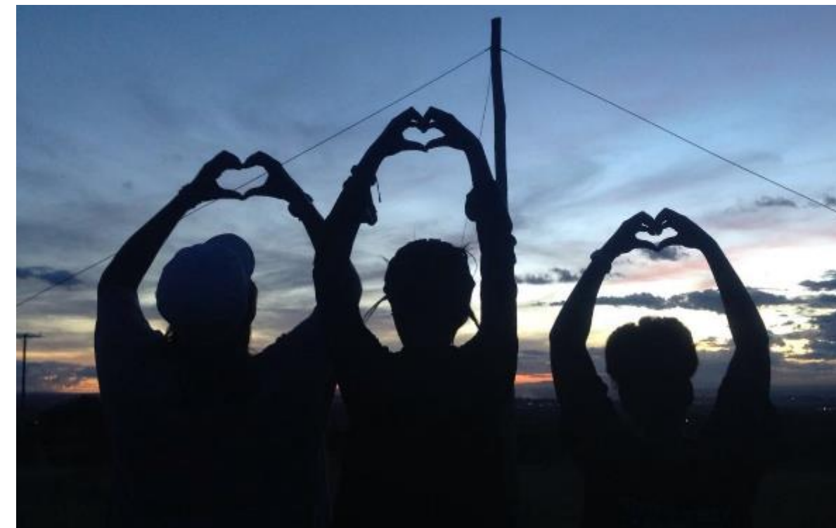
Successful Daystar University Orientation week programs over the years