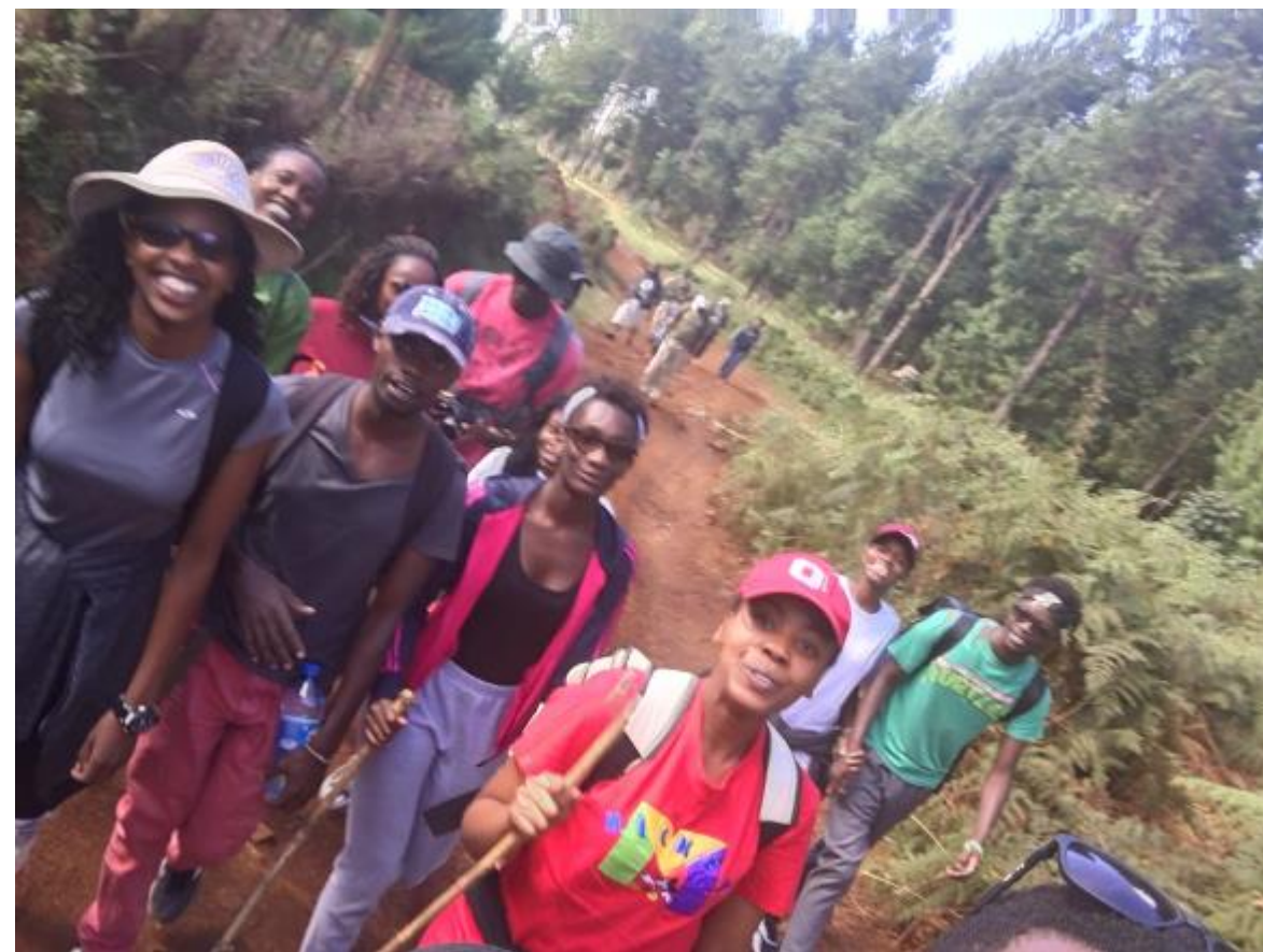
Rock Climbing and Expeditions Trips