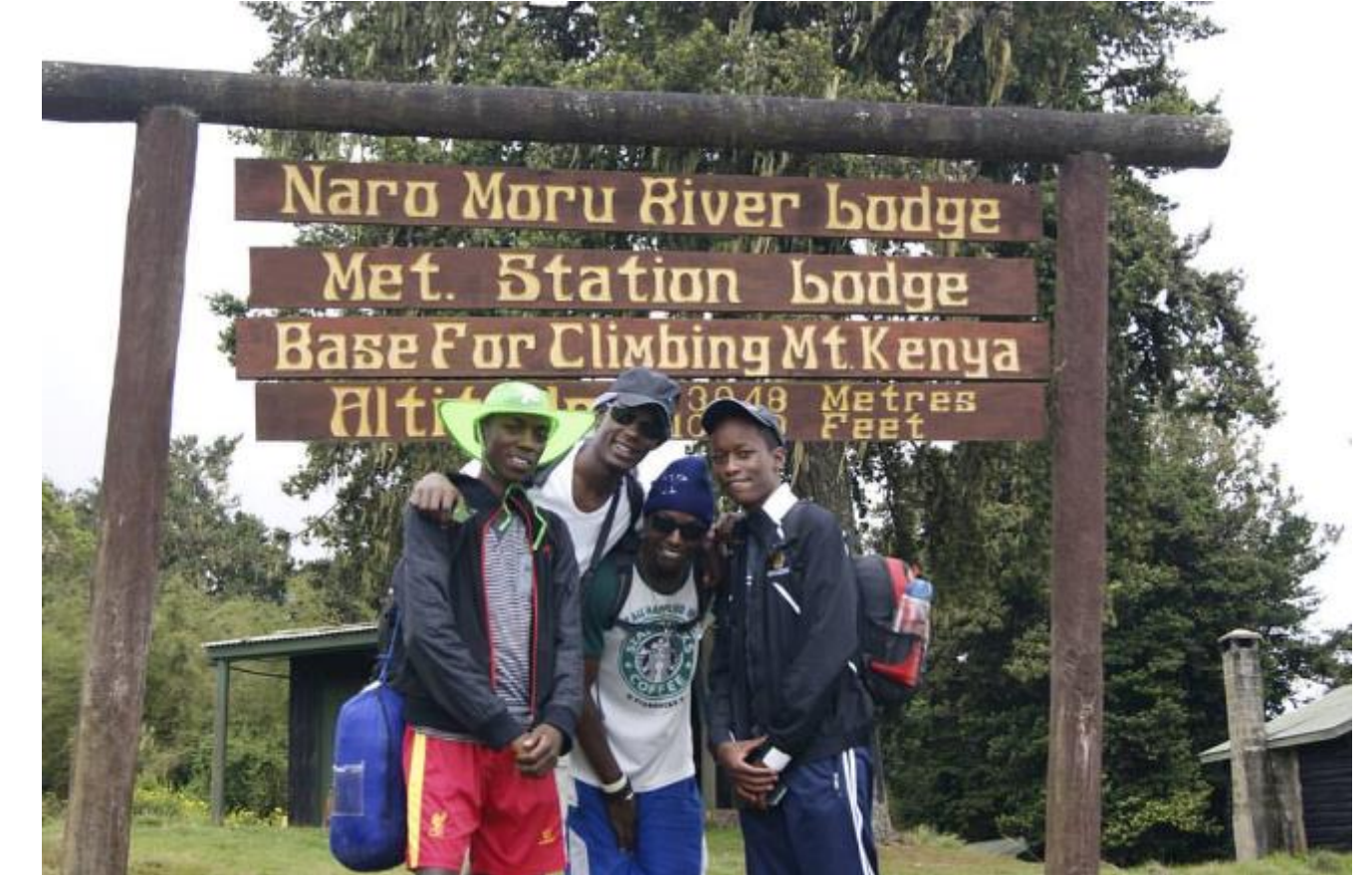
Conquering various Mountains and Hills